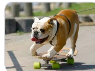
Ollie Age: 5

House Trained: N Spayed/Neutered: N Likes Cats: N Likes Kids: N Very Active: Y