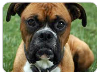
Terry Age: 20

House Trained: Y Spayed/Neutered: Y Likes Cats: N Likes Kids: Y Very Active: Y