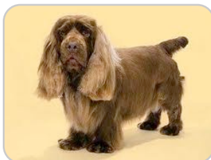
Gizmo Age: 8

House Trained: Y Spayed/Neutered: Y Likes Cats: N Likes Kids: Y Very Active: Y