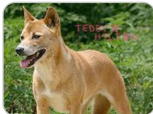
Eunice Age: 19

House Trained: N Spayed/Neutered: N Likes Cats: Y Likes Kids: N Very Active: Y