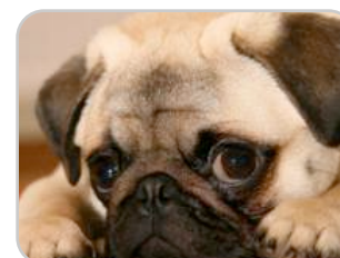
Hero Age: 1

House Trained: N Spayed/Neutered: N Likes Cats: Y Likes Kids: Y Very Active: N