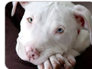
Uno Age: 12

House Trained: Y Spayed/Neutered: N Likes Cats: Y Likes Kids: Y Very Active: Y