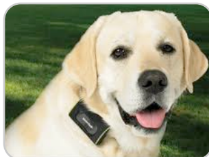
Sadie Age: 1

House Trained: Y Spayed/Neutered: N Likes Cats: N Likes Kids: N Very Active: Y