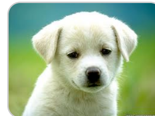
Phillip Age: 3

House Trained: N Spayed/Neutered: Y Likes Cats: N Likes Kids: Y Very Active: N