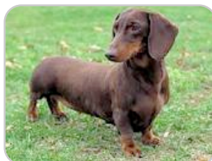
Nipper Age: 18

House Trained: N Spayed/Neutered: N Likes Cats: Y Likes Kids: N Very Active: N