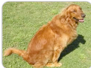
Larry Age: 15

House Trained: N Spayed/Neutered: N Likes Cats: Y Likes Kids: N Very Active: Y