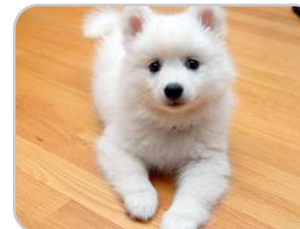
Noodle Age: 25

House Trained: N Spayed/Neutered: N Likes Cats: Y Likes Kids: N Very Active: Y