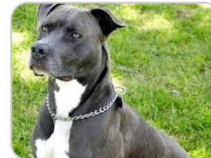
Riely Age: 9

House Trained: N Spayed/Neutered: N Likes Cats: N Likes Kids: N Very Active: Y