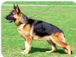
Tom Age: 2

If you need hints or more information visit http://puzzledpint.com .