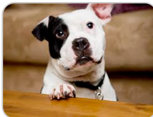
Mason Age: 15

House Trained: N Spayed/Neutered: N Likes Cats: Y Likes Kids: N Very Active: Y