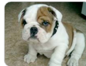
Echo Age: 14

House Trained: Y Spayed/Neutered: N Likes Cats: N Likes Kids: N Very Active: Y