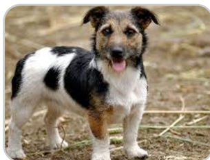
Tootsie Age: 1

House Trained: Y Spayed/Neutered: N Likes Cats: N Likes Kids: N Very Active: N