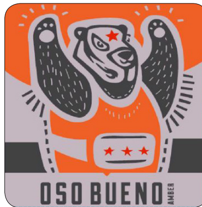
"Mouthwatering!" Oso Bueno