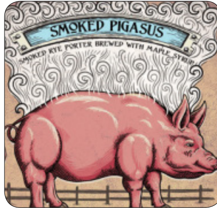
"Darned tasty!" Smoked Pigasus