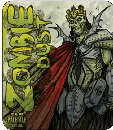
"Quite devilish!" Zombie Dust