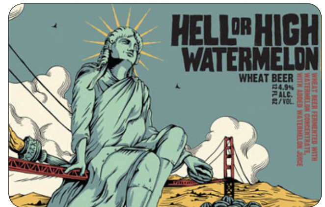
"Put this in your picnic basket!" Hell or High Watermelon