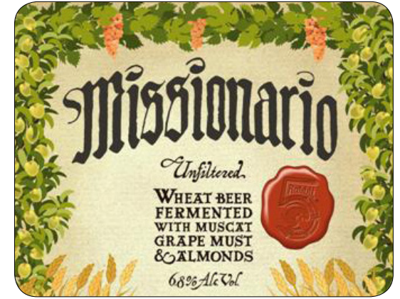
"Smooth as silk!" Gran Missionario