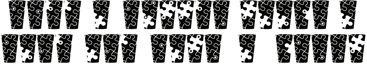
Hold a puzzle, raise a pint, and give a cheer