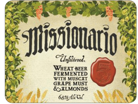
"Smooth as silk!" Gran Missionario