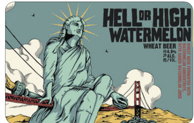
"Put this in your picnic basket!" Hell or High Watermelon

This is the location puzzle for Puzzled Pint on June 14, 2016 . Use the answer word (all lowercase) to complete this URL and get event details for your city: http://www.puzzledpint.com/puzzles/june-2016/brewery-tours/_____