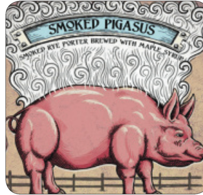
"Darned tasty!" Smoked Pigasus