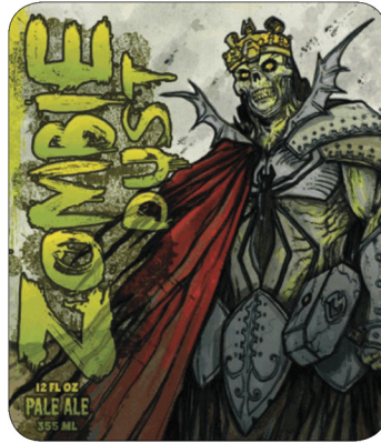
"Quite devilish!" Zombie Dust