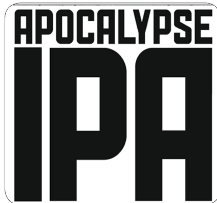
"Zestily hoppy!" Apocalypse